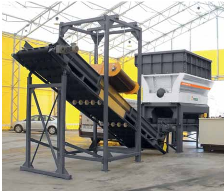
M&J Eta®PreShred Stationary 2000

We have developed special models to perform efficiently on specific types of material. These differences in capability are determined by – for example – the size of the cutting area, the number of shafts, the design of the rotating knives and the available motor power.