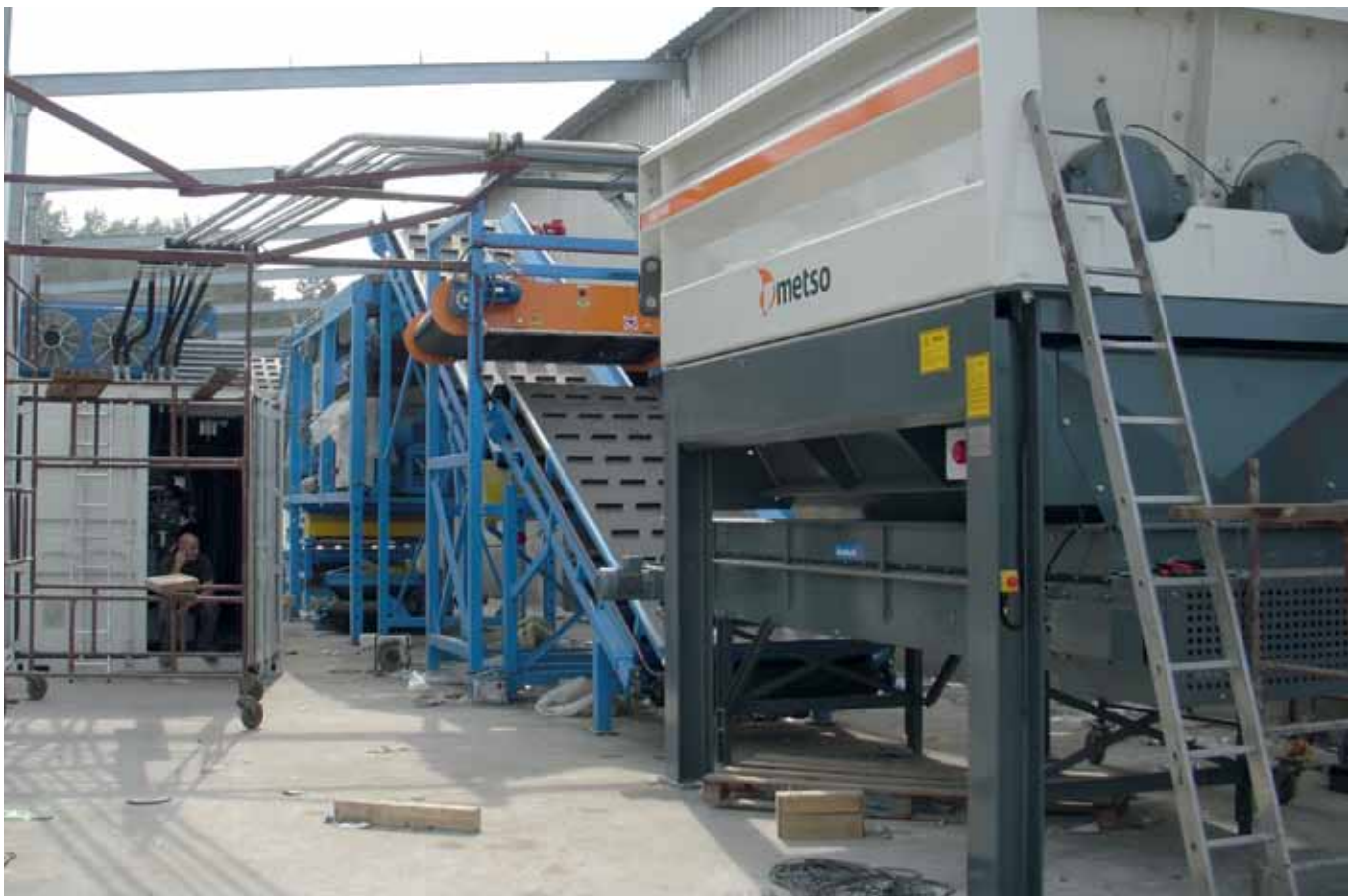
M&J Eta ® PreShred Stationary 4000