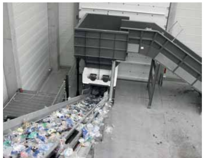
M&J Eta®PreShred 1000 stationary