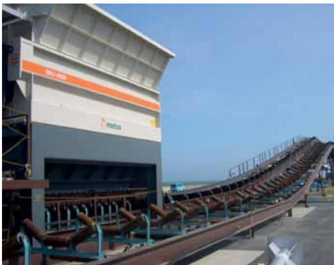
M&J Eta®PreShred 6000 stationary