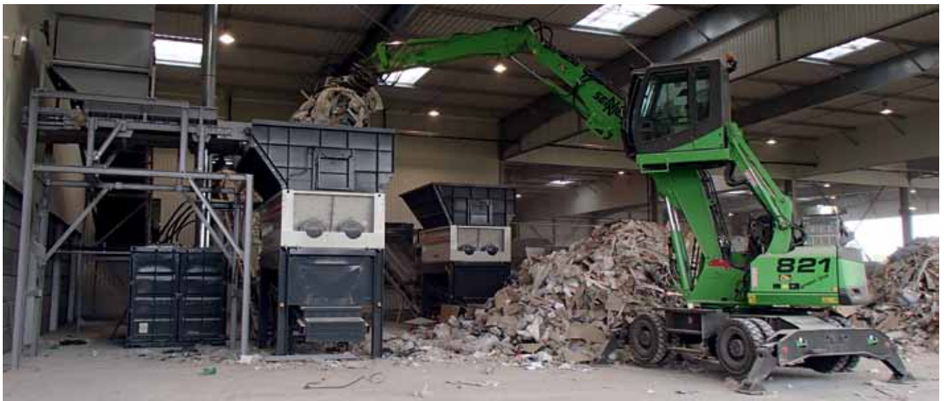
M&J Eta®PreShred 4000 stationary

The M&J Eta®PreShred 6000 is one of the largest pre-shredders on the market, and is capable of shredding large volumes of any kind of waste. The unit is ideal when there is a need for very high capacities or for shredding material that is either extremely bulky or very heavy.