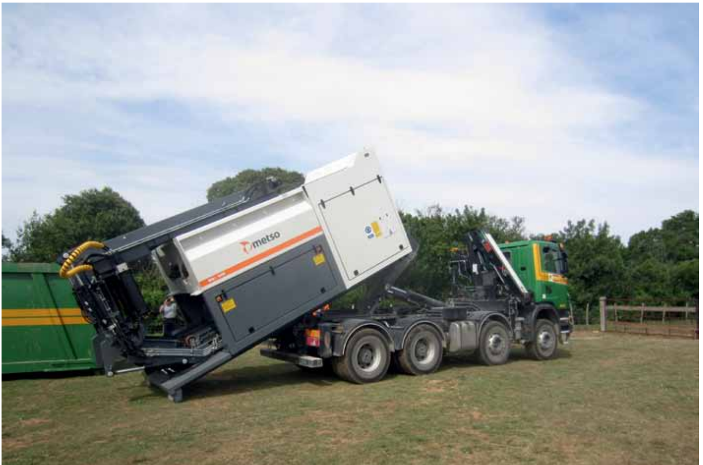
M&J Eta ® PreShred 1000 Mobile Hooklift

All Metso shredders share certain basic features and exceptionally robust construction. We use components from internationally recognized suppliers, to ensure maximum performance and durability.