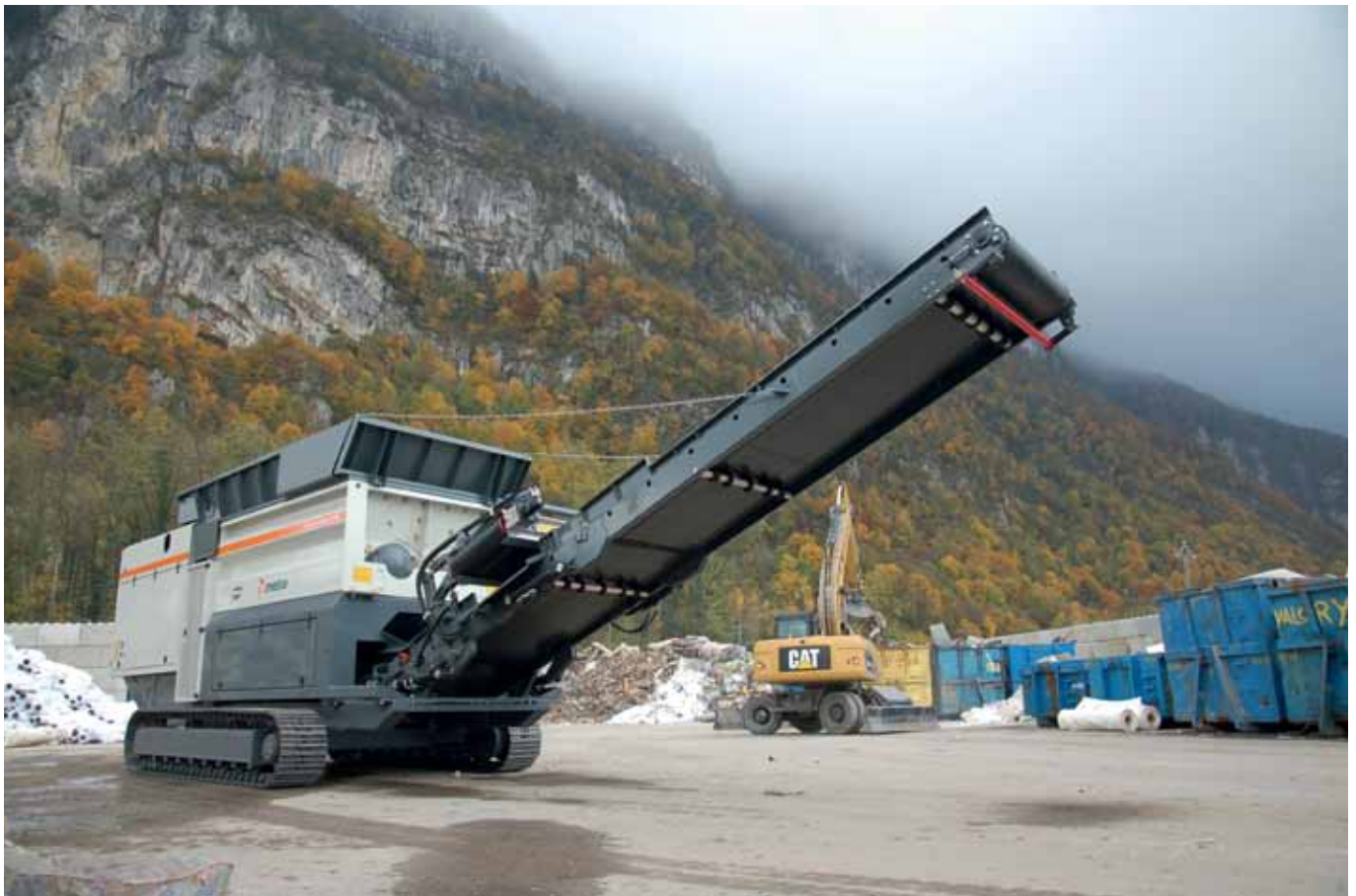
M&J Eta ® PreShred 4000 Mobile crawler